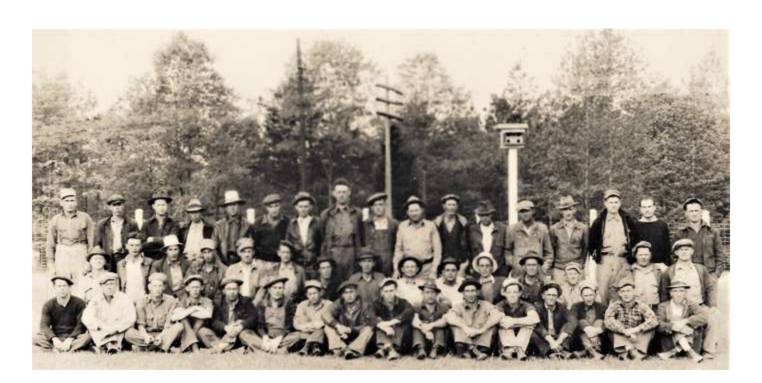
Can You identify anyone in this photo from Caroline County? Picture is believed to be an R.F.&P. Railroad work crew. Photographer's business was in Port Royal.

If anyone can identify or verify the identities of the four gentlemen, please see the contact information at the end of this newsletter.