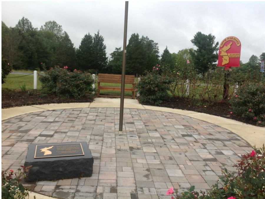
Korean War Memorial Garden planned and created by the Caroline Middle School History Club.

The unanimous decision to select the Caroline Middle School History Club was based on their efforts to create, plan, and manage the construction of the Korean War Memorial Garden located at Caroline High School on the corner of Rogers Clark Boulevard (Route 207) and Devils Three Jump Road. This memorial garden was constructed at that location because it falls on the 38th parallel, the same latitude that became so famous during the Korean War (1950–1953). This garden was not only constructed as a memorial to the Korean War but as a place to reflect and honor not only Korean War veterans but all veterans of the United States military. Since being completed, the memorial garden has been used for several Veterans Day ceremonies.