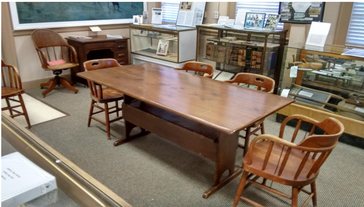
Former USO building table and chairs donated to CHS by the town of Bowling Green.

The town of Bowling Green has donated six oak chairs that were part of the original furnishings when the town hall was built as a USO building during World War II. The six chairs were used in the town hall from 1942 until recently. We are very pleased to have these pieces of local history from that era. The chairs and table are currently being used in our display area. Special thanks to the Bowling Green Town Council for their donation.